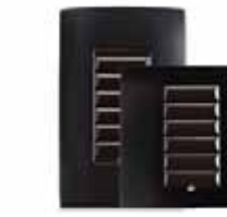
Venetian Bronze (Metal)