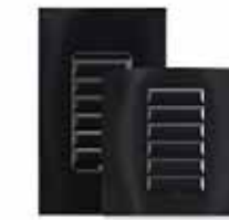
Midnight Black (Satin Finish)