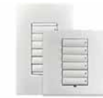
Snow White (Satin Finish)