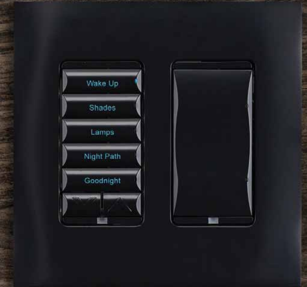
Keypad shown in actual size