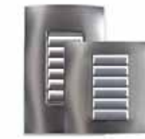
Stainless Steel (Metal)