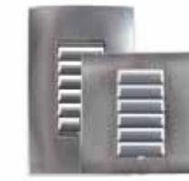
Satin Nickel (Metal)